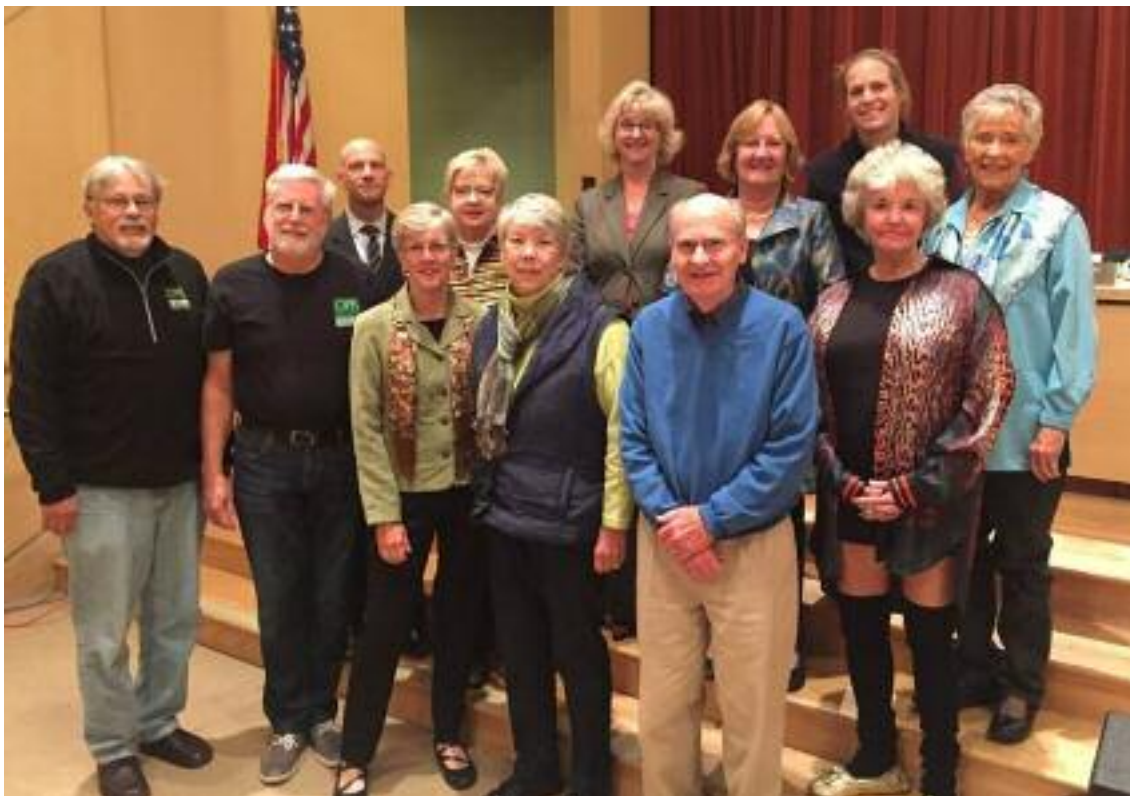
The Orinda Park and Recreation Foundation turned 40 years old in 2015. The foundation provides enhancements and improvements for Orinda's parks and recreational facilities as part of its work on behalf of the community. The Orinda City Council gave official recognition to the occasion at a Nov. 3 council meeting. Shown here are present and former OPR Foundation board members with the Orinda City Council.